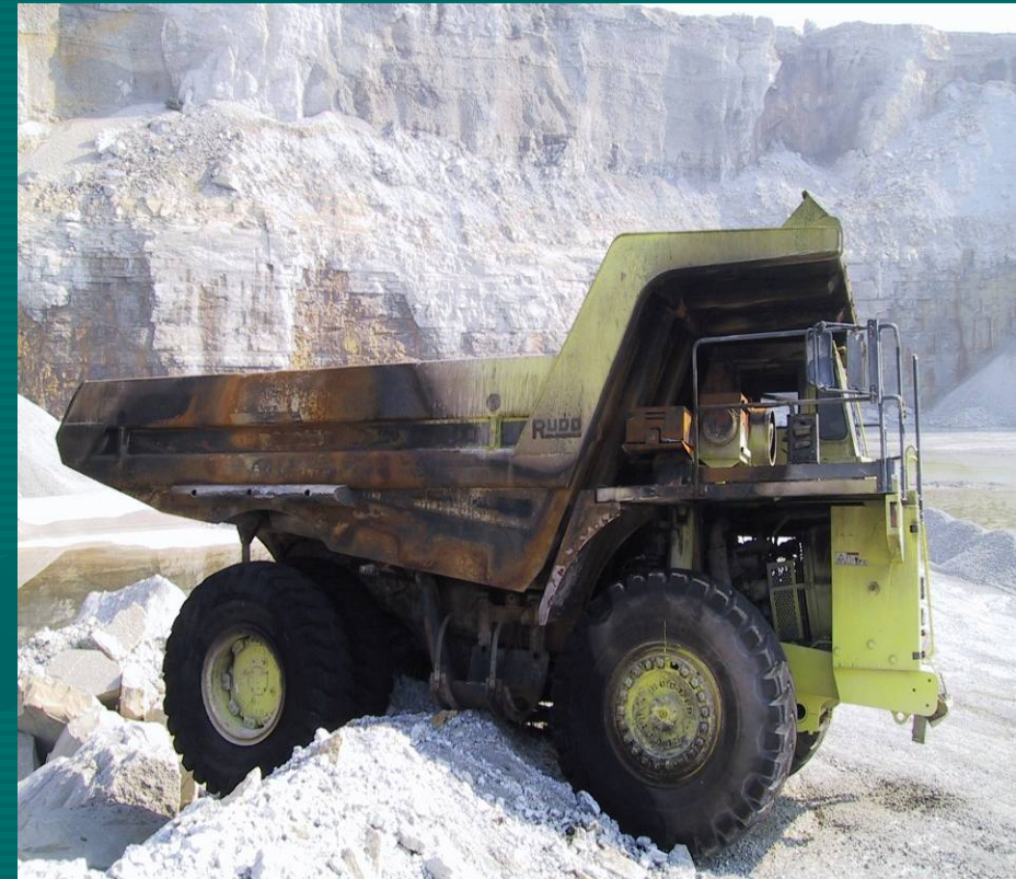
Machine Fire Suppression Systems