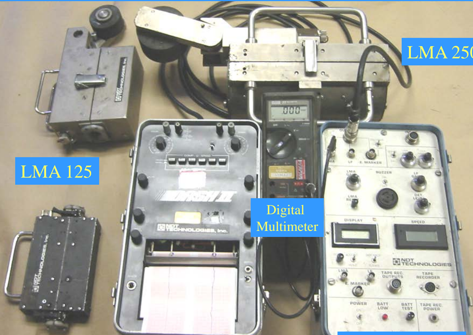
Strip Chart Recorder