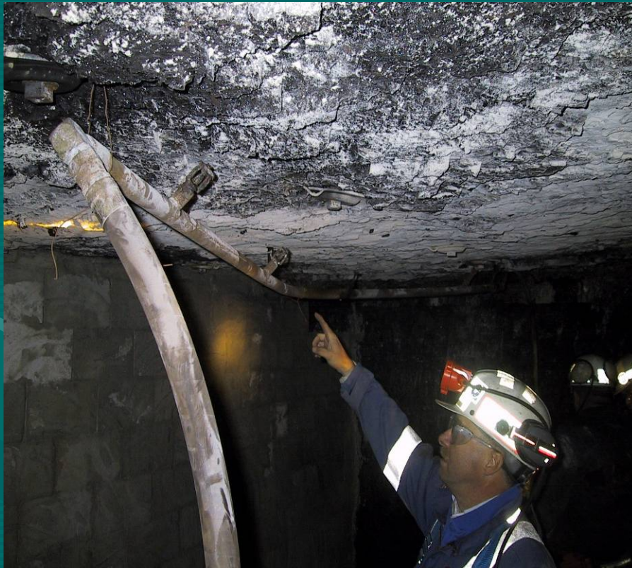
Fire Suppression Systems in Mines